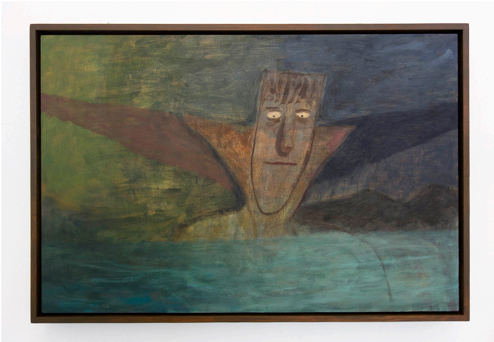
Darkstar 2021 oil and acrylic on wooden panel 40 x 60 cm