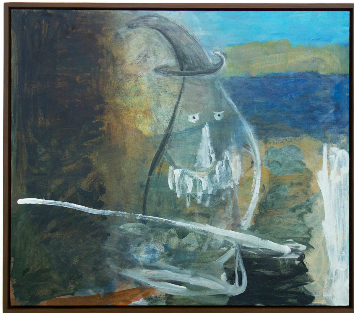
Untitled (2025) 2021 oil and acrylic on paper mounted on wooden panel 54.5 x 63.5 cm