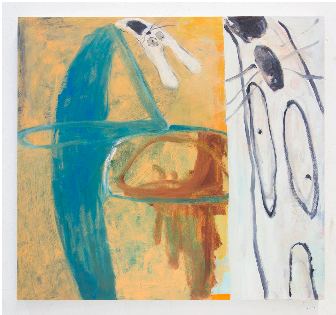
Crazy hot summer 2020 oil and acrylic on paper mounted on wooden panel 60 x 65 cm