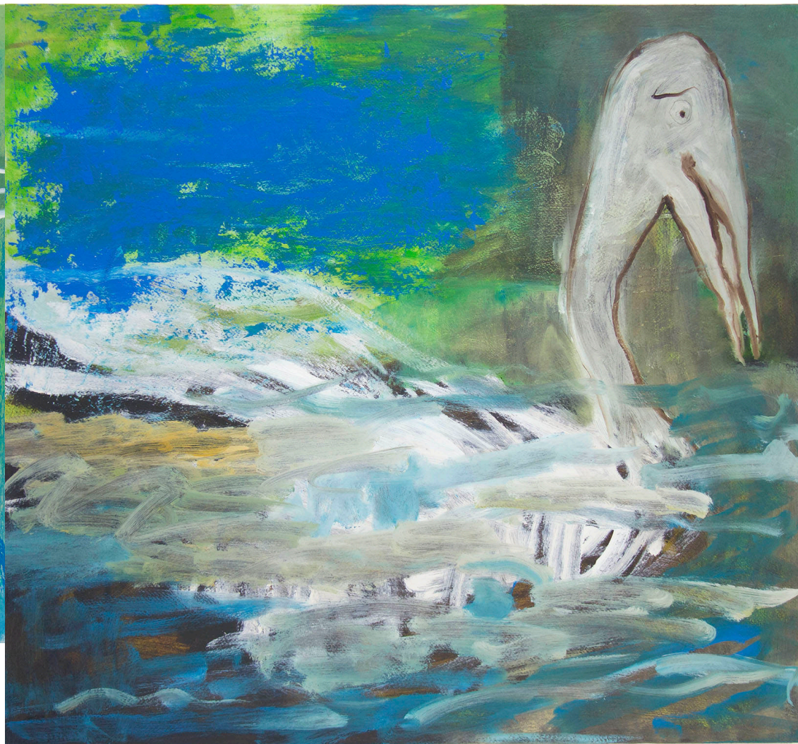
Untitled (SWAN) 2020 oil and acrylic on paper mounted on wooden panel 40 x 50 cm Swimming bird 2020 oil and acrylic on paper mounted on wooden panel 60 x 65 cm