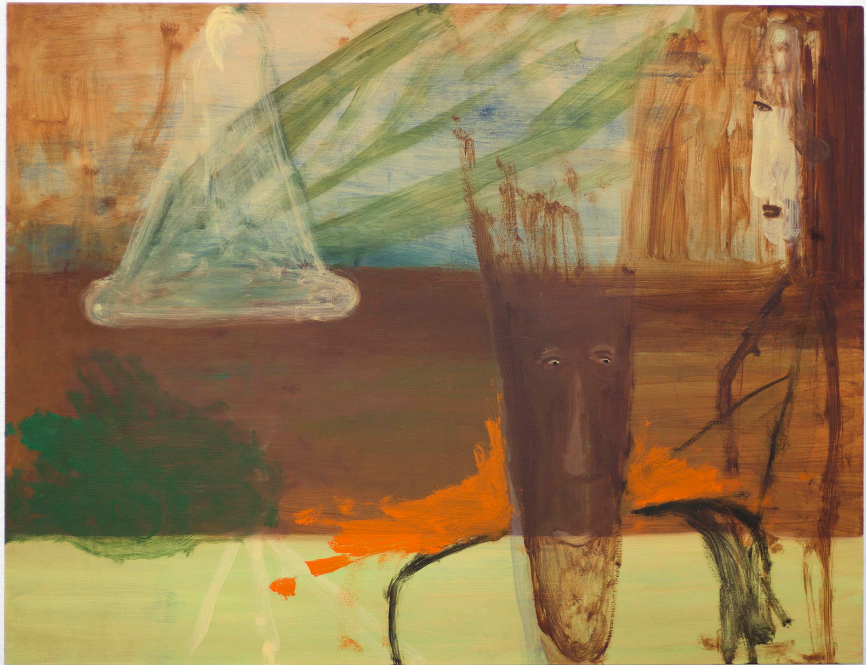
Bell 2021 oil and acrylic on wooden panel 50 x 65 cm