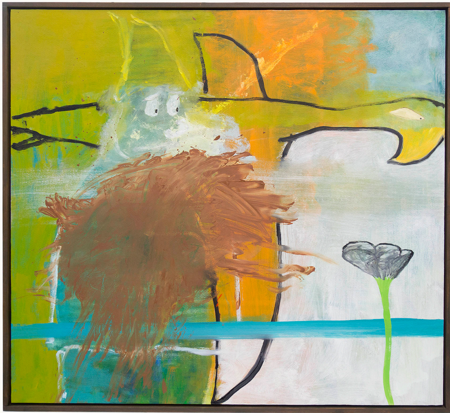
Louder than everything else, faster than everything else 2020 oil and acrylic on paper mounted on wooden panel 70 x 85 cm