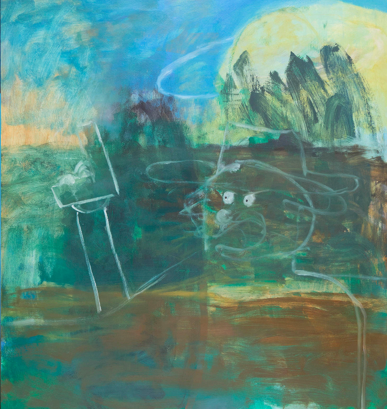
Wilderness 2020 oil and acrylic on paper mounted on wooden panel 80 x 75cm