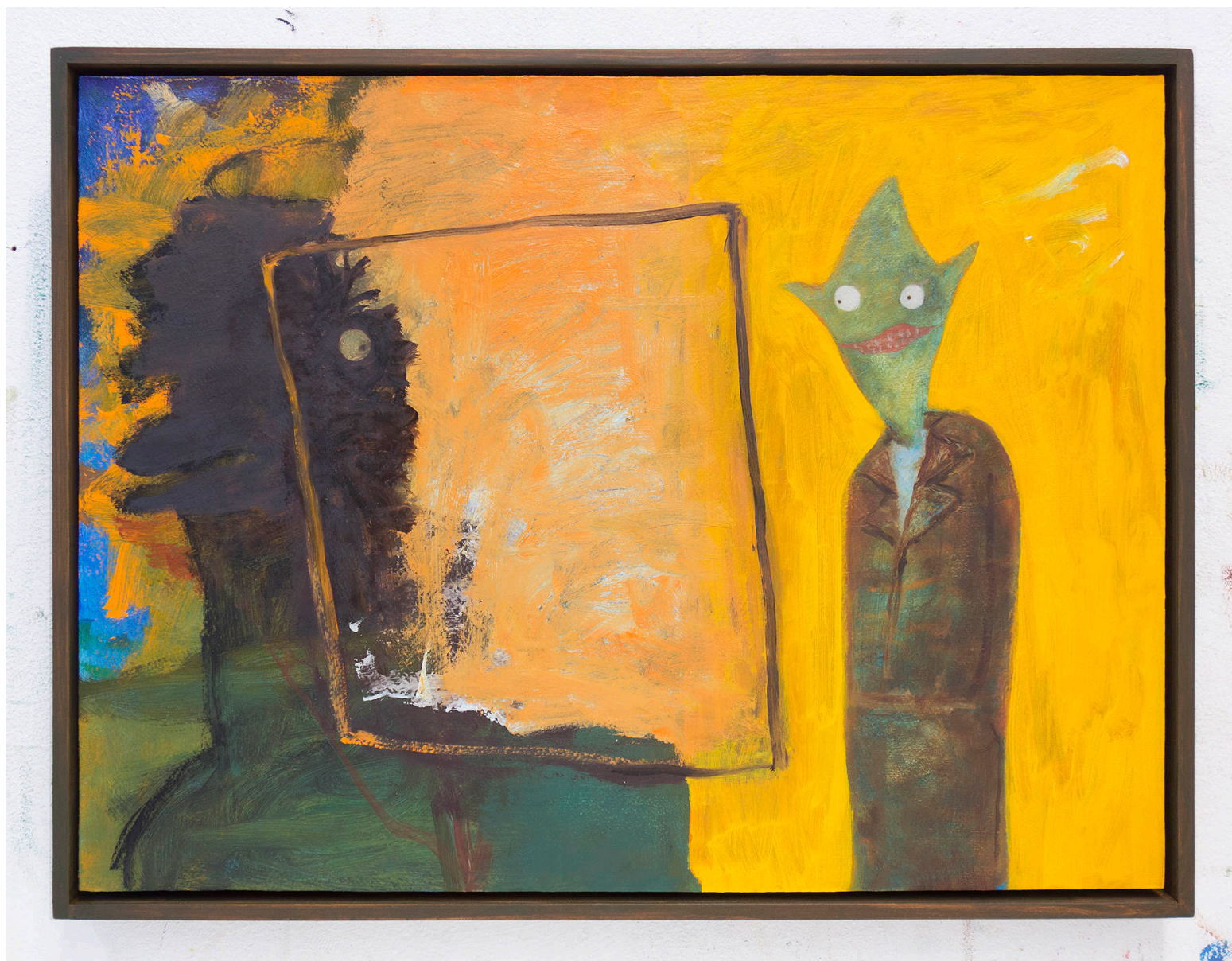
TV 2020 oil and acrylic on paper mounted on wooden panel 45 x 60 cm