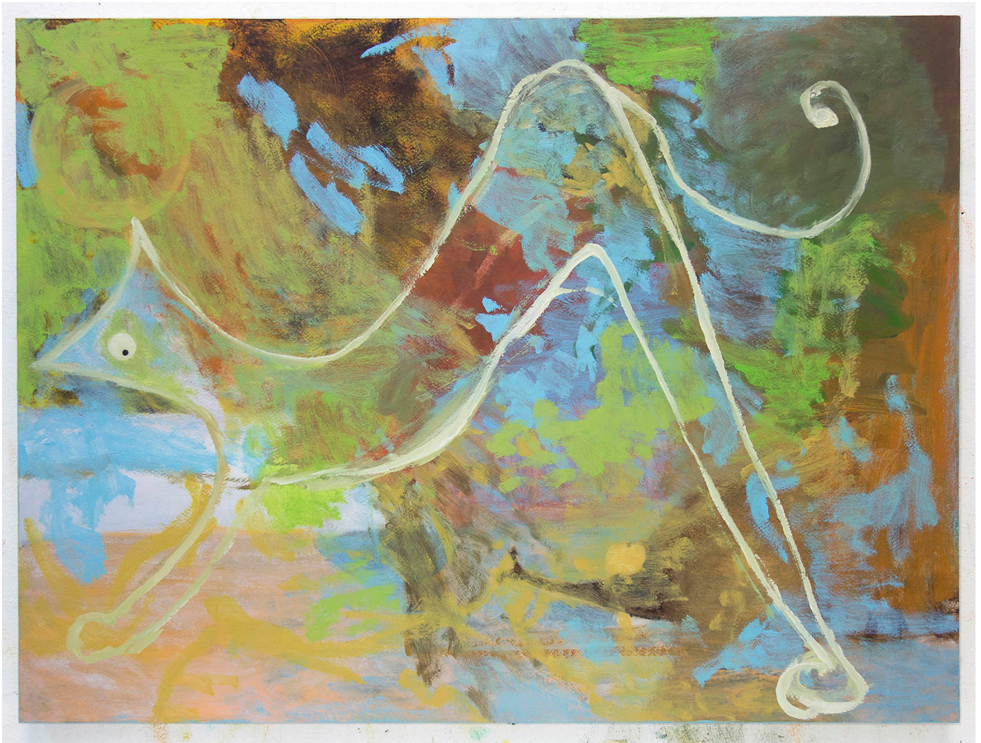
Katze 2020 oil and acrylic on paper mounted on wooden panel 60 x 80 cm