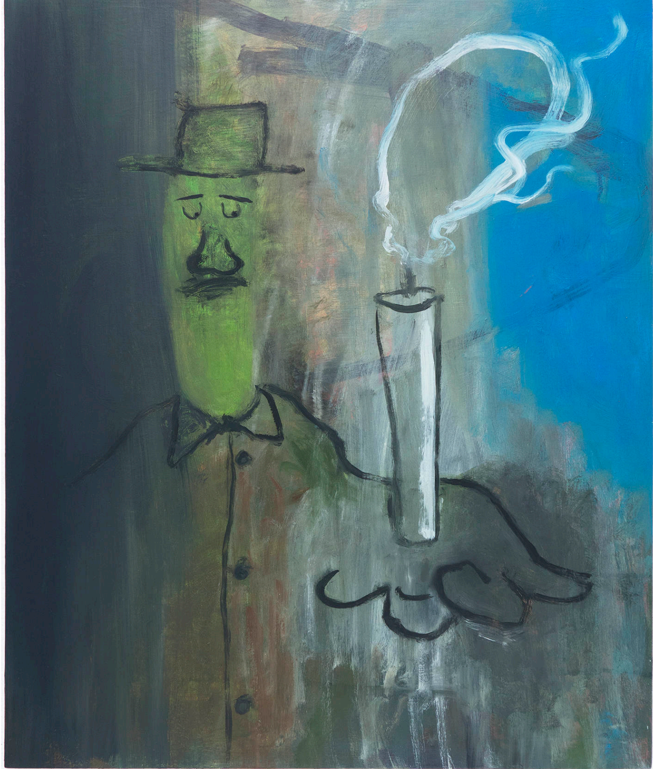
No Problem! 2021 oil and acrylic on wooden panel 60 x 50 cm