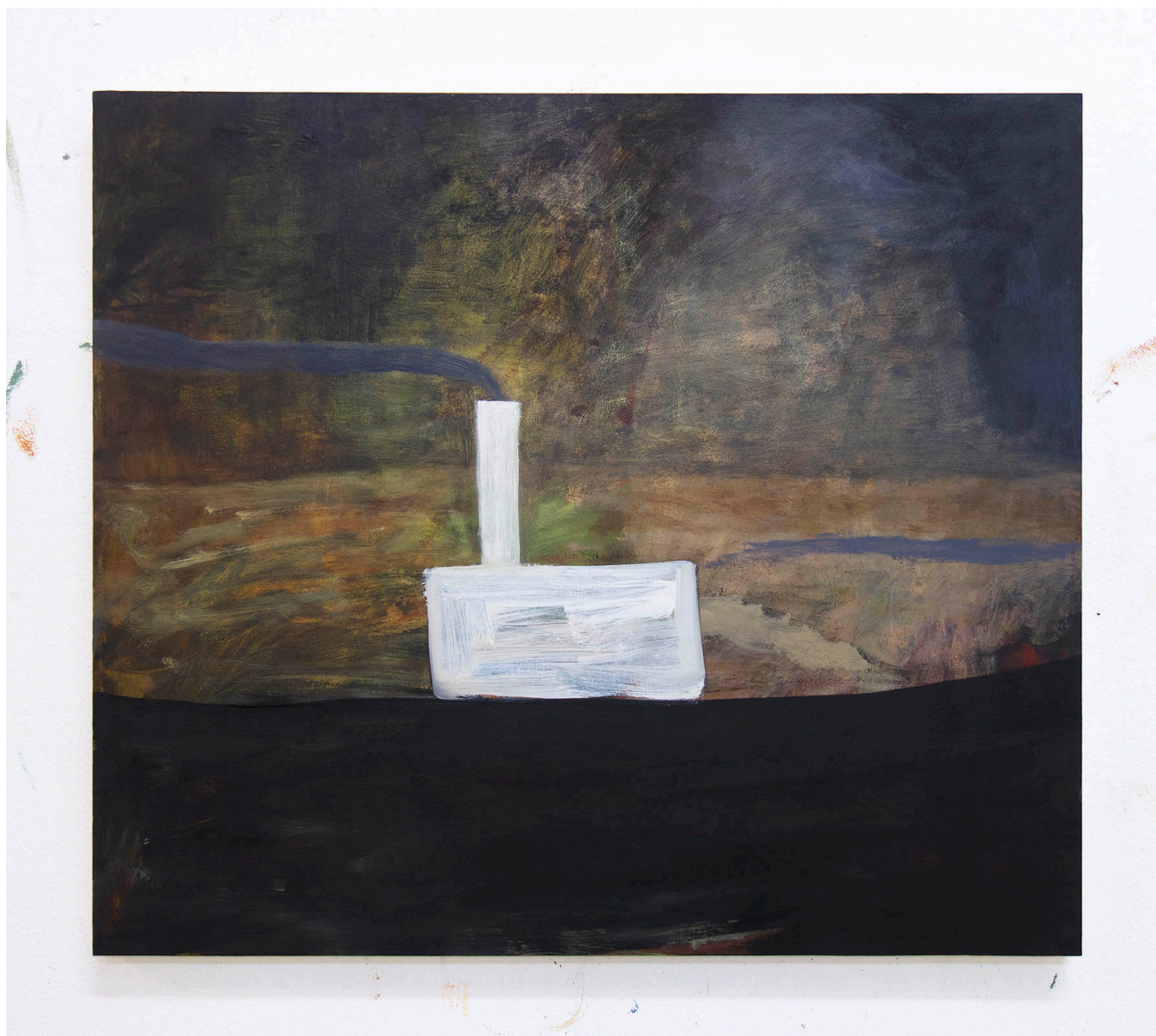
Schiff 2020 oil and acrylic on paper mounted on wooden panel 54.5 x 63.5 cm