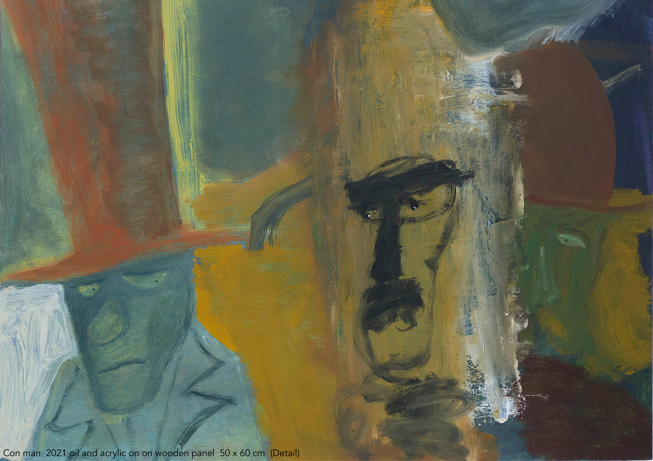
Con man, 2021 oil and acrylic on on wooden panel 50 x 60 cm (Detail)