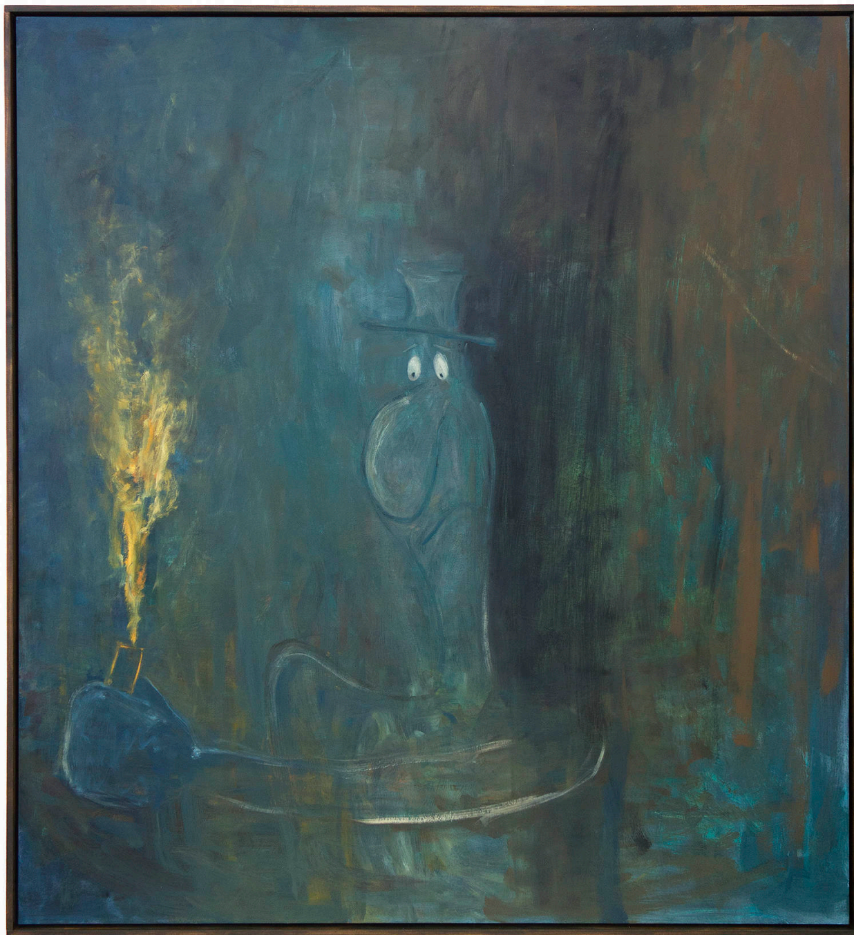
Don't talk with yourself 2021 oil and acrylic on wooden panel 120 x 110 cm