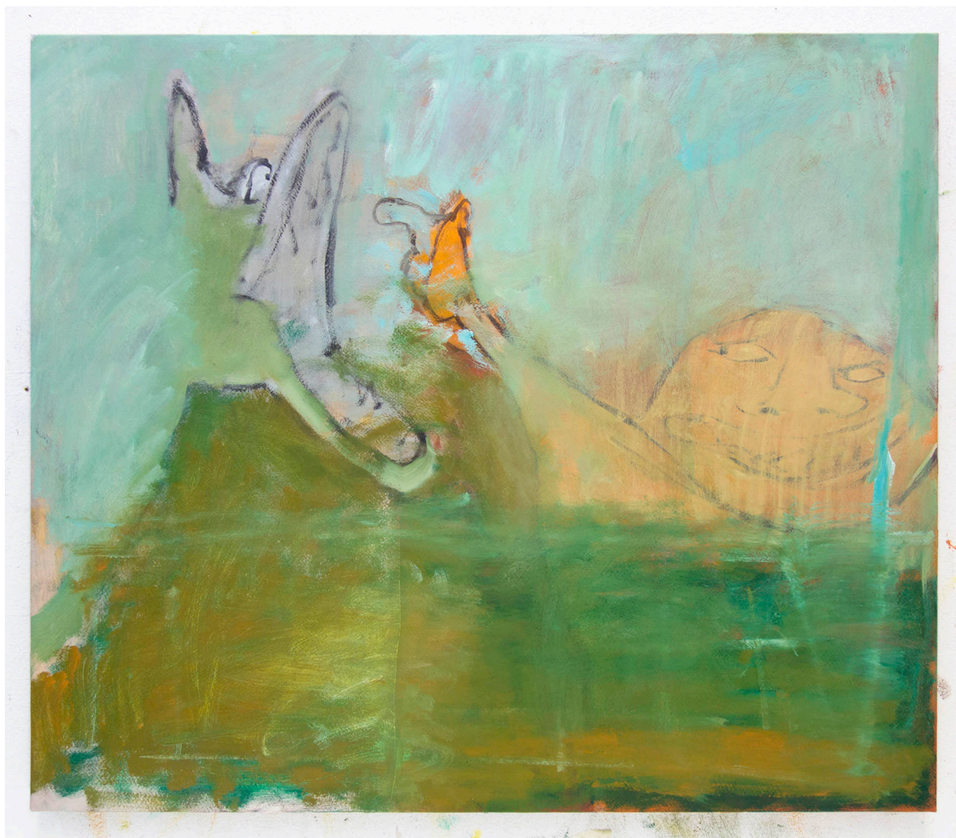
Feld 2020 oil and acrylic on paper mounted on wooden panel 60 x 70 cm