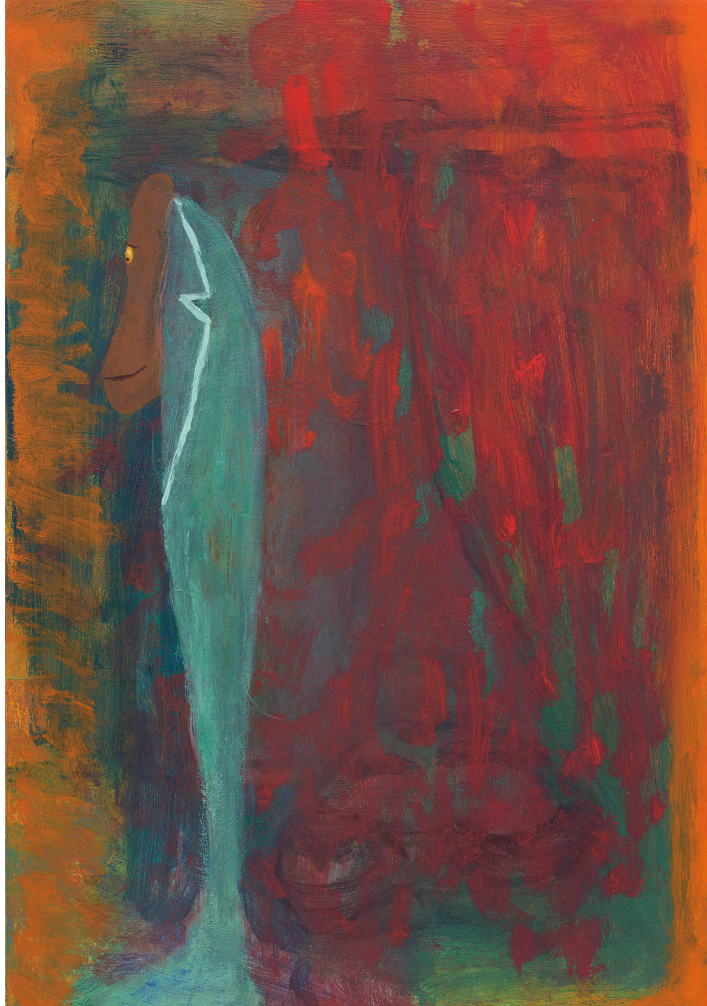
Tick tuck, tick tuck 2021 oil and acrylic on wooden panel 42 x 29.7 cm