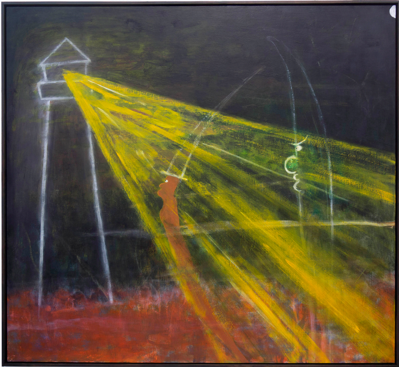
Leuchtturm 2020 oil and acrylic on wooden panel 110 x 120 cm