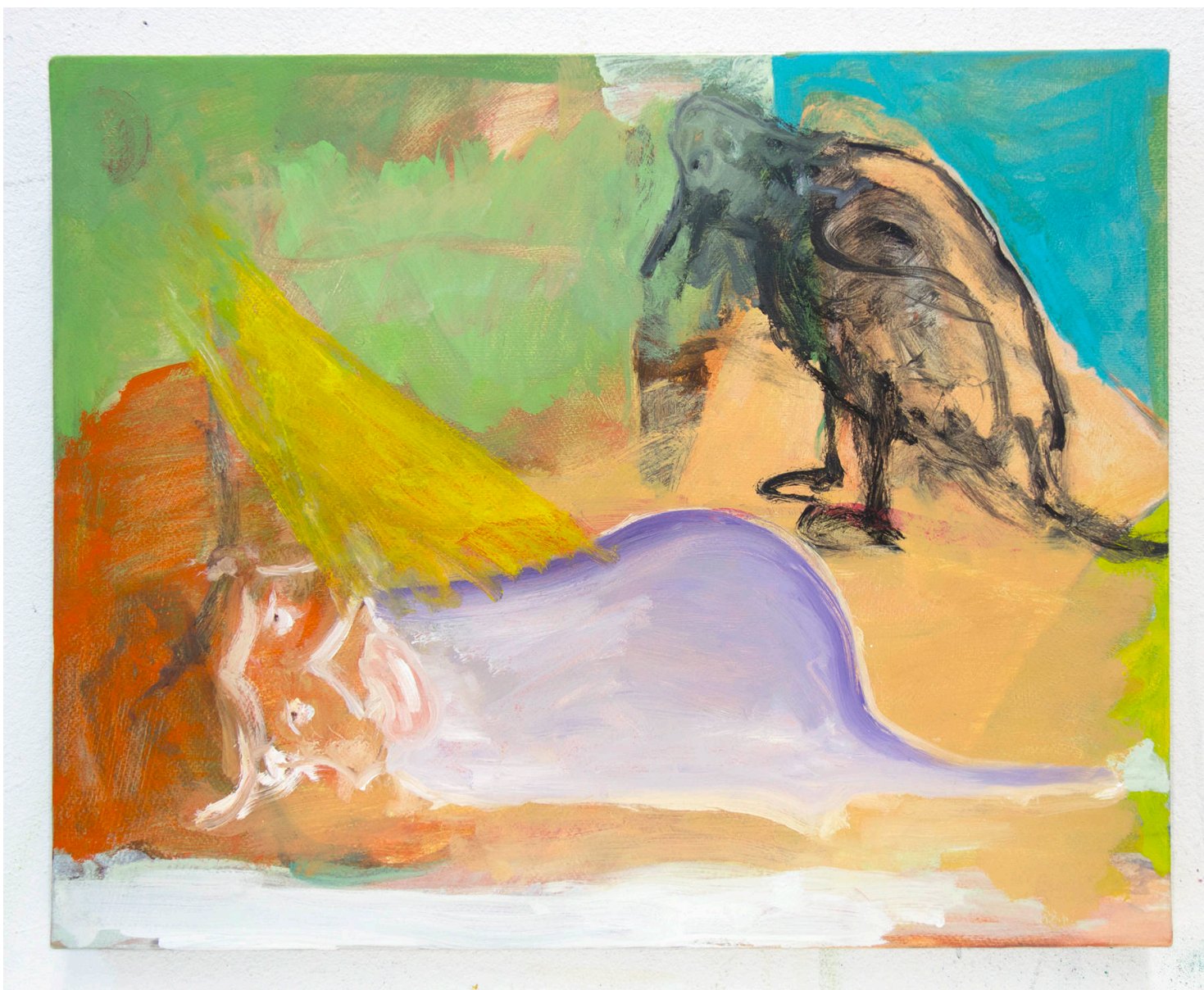
In the light of the miracle 2020 oil and acrylic on paper mounted on wooden panel 40 x 50 cm