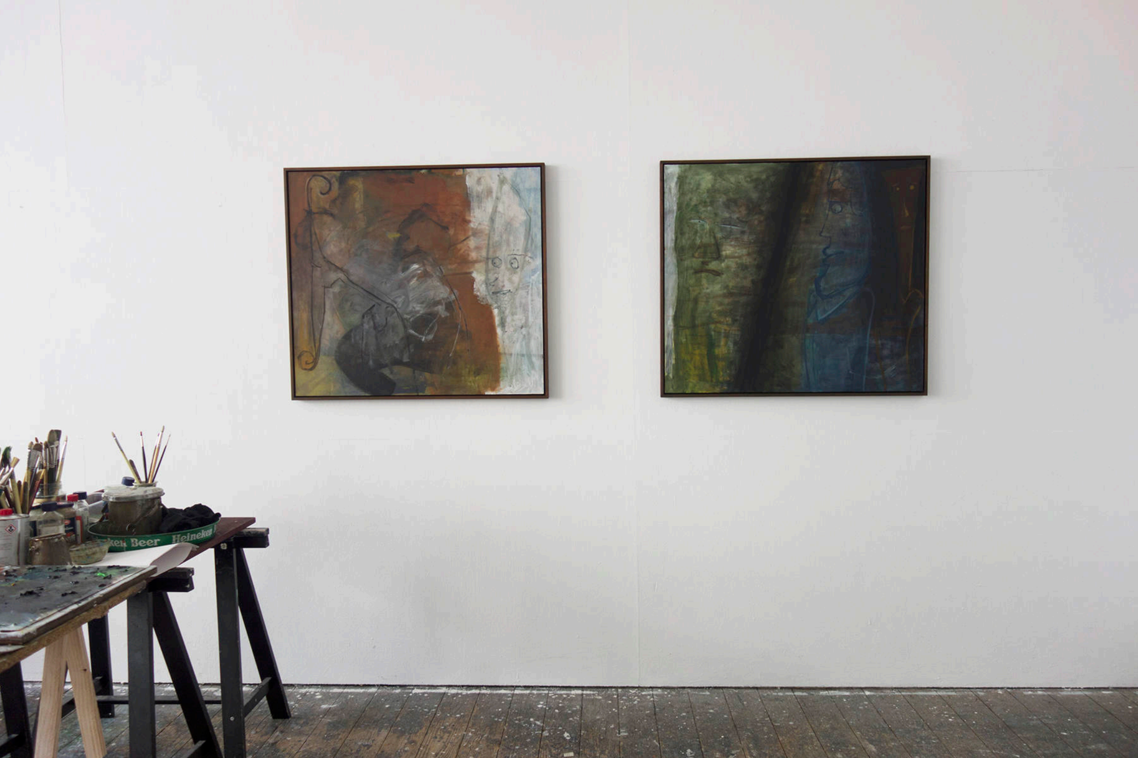
Studio view 2021