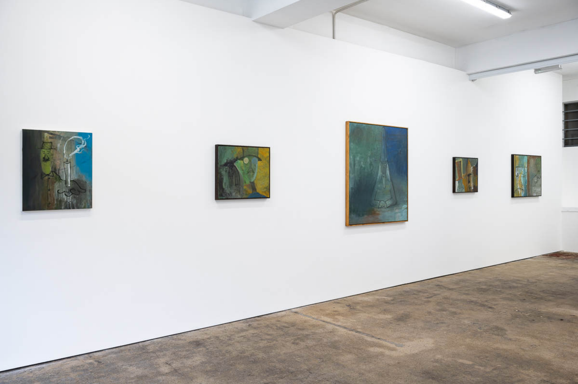
Installation view solo show "Good con man" 2021 Claas Reiss London