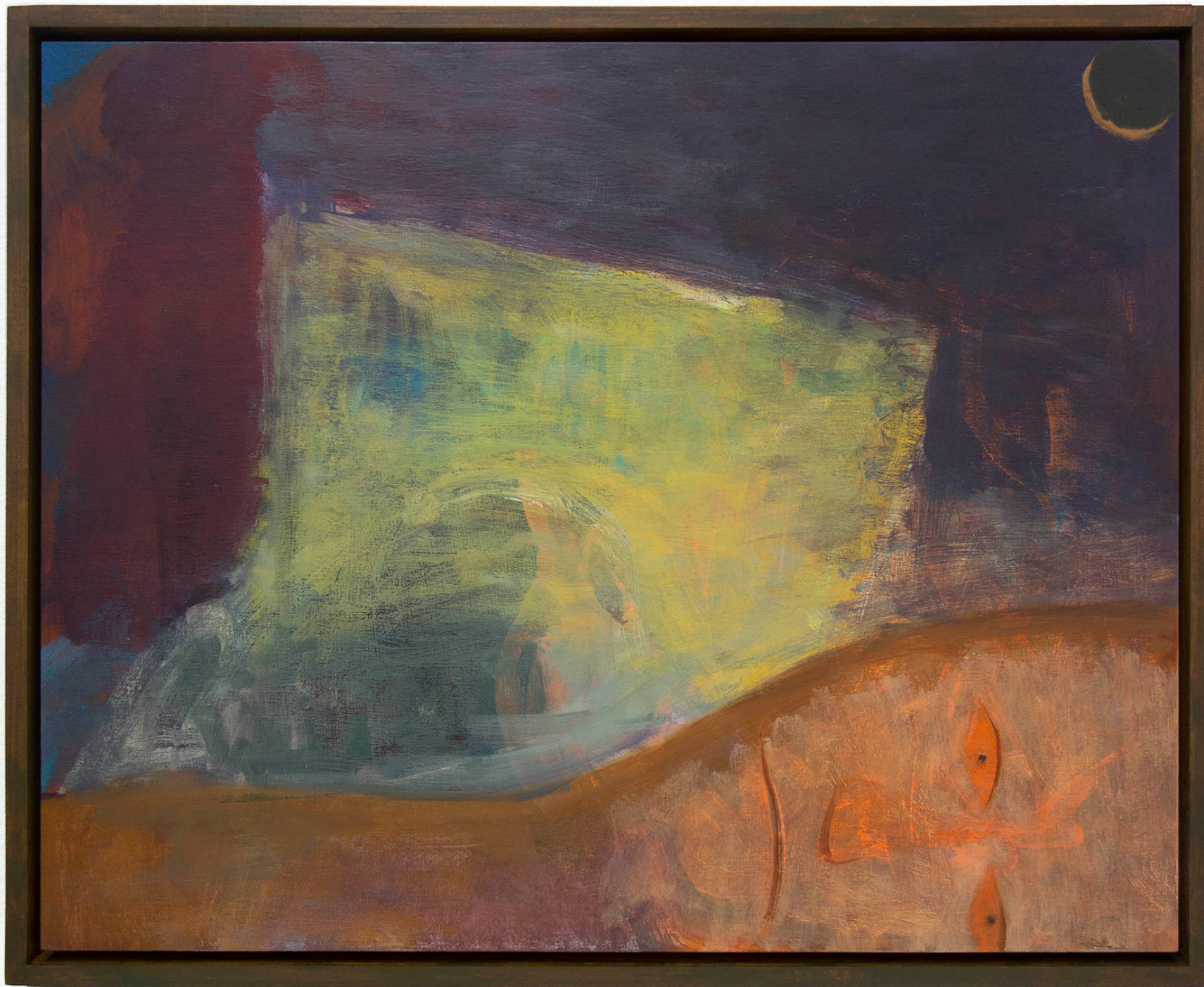
Paris Night 2020 oil and acrylic on wooden panel 40 x 50 cm